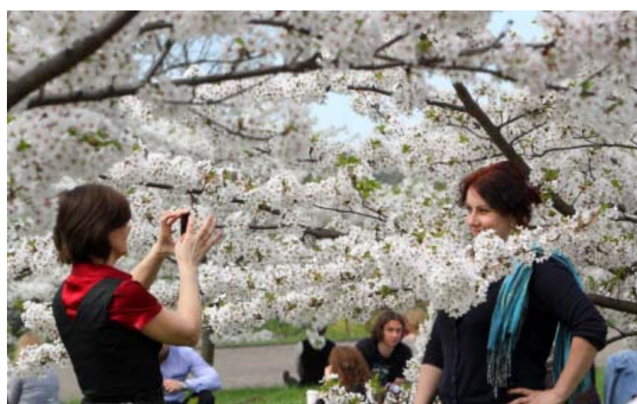
Cherry blossom in Vancouver.

Vancouver's earliest ornamental cherry trees were a gift from the cities of Yokohama and Kobe. To mark the launch of the book, new cherry trees will be planted VanDusen.