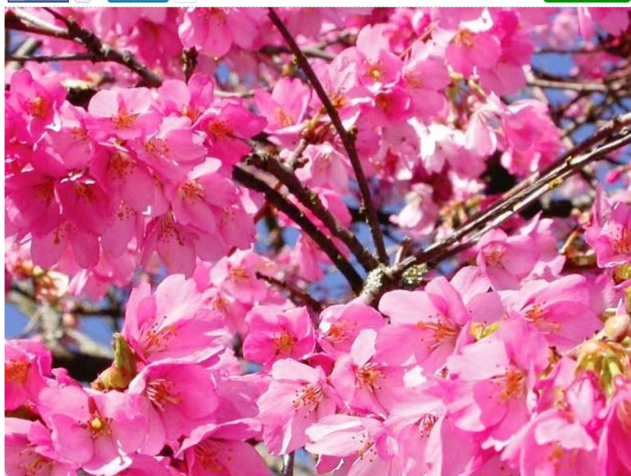
Vancouver cherry blossoms.