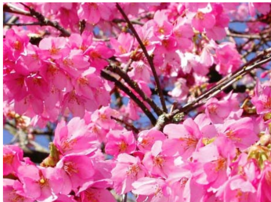
Vancouver cherry blossoms.

Nineteen new varieties have been added to the book bringing the total number of cultivars featured to 54. It is estimated there are about 40,000 cherry trees planted in Vancouver.